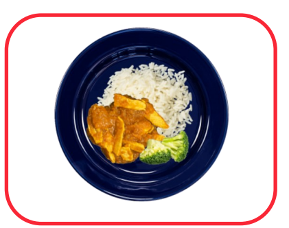
Mild Chicken Curry with Rice