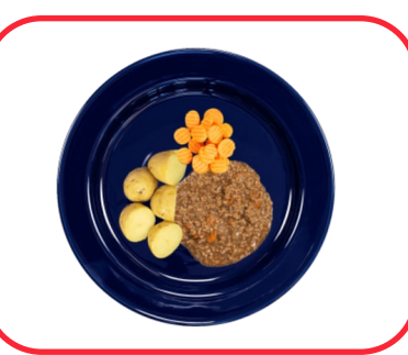
Traditional Mince with Baby Boiled Potatoes