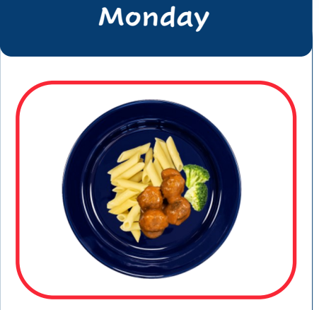
Vegeballs in Tomato Sauce with Pasta (Ve)